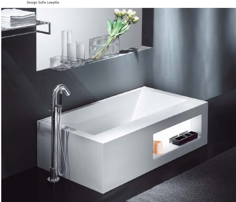
Your bathroom: a reflection of you.

With Corian®, you can make the most personal room in your home truly you. Surround yourself with colours and textures you love to wake up to. Design Corian® into soothing shapes. Combine it with tile, metal, wood, stone or glass. And because Corian® is so easy to live with, choosing it will reflect not only your sense of style, but your practical side, too.