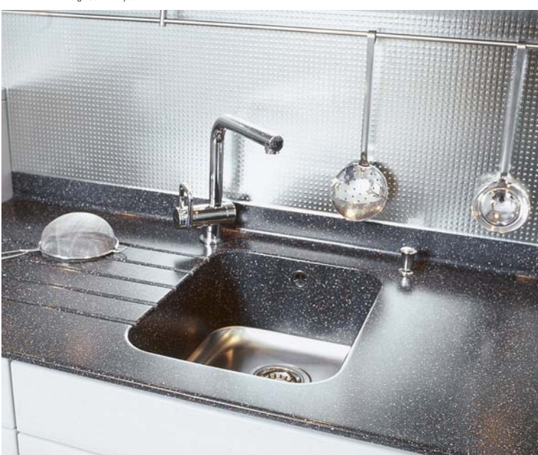
Let your imagination out of the box.

A kitchen is just an empty box. Until you add your imagination. That's surprisingly easy with Corian®. Shape it. Sculpt it. Run it up a wall or down the side of a cabinet. Let your imagination loose with colour, shape and detail. There are no rules. Have fun.